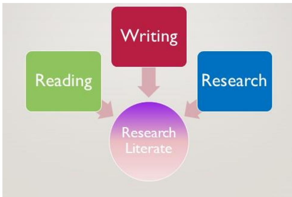
Figure 1: Becoming research literate at tertiary level

As a first step, the three researchers conducted an independent analysis of the full transcriptions in order to identify salient themes or patterns (Wolcott, 1994, 142). Researchers then met to discuss these initial themes and recurrent patterns. It was noticed that participants referred to their research activity through a variety of tasks that were either self-assigned or assigned by their supervisors. As these tasks appeared to be grouped and overlapping at the same time, charts to attempt to classify these tasks were designed for researchers to use in a second independent analysis. The emergent categories under which tasks were to be placed were reading, writing and research, as figure one below shows.